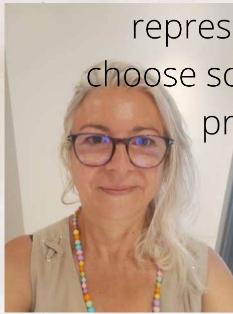
President of Maison de la Santé Mentale

The new president of the association represent citizens - it was important to choose someone different than a healthcare professional for that position.