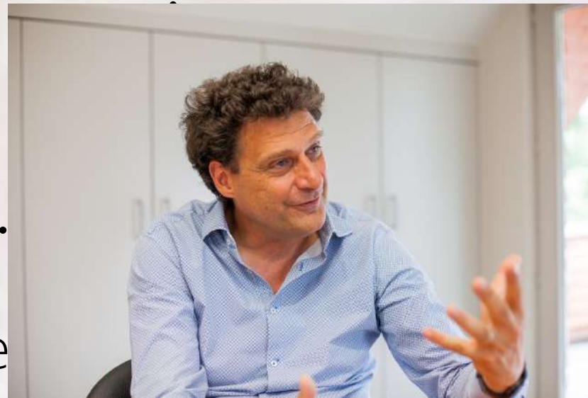
CEO of De LOVIE